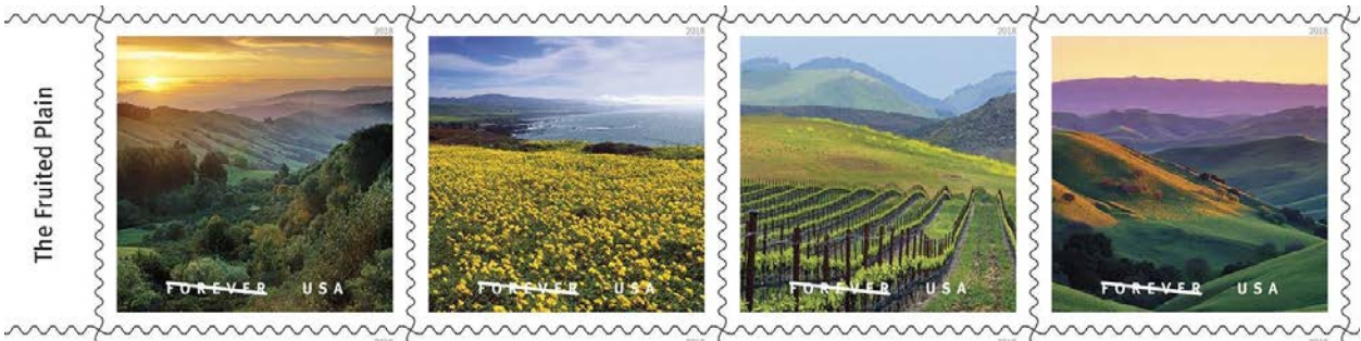
Sunrise near Orinda, CA, Pigeon Point near Pescadero, CA, Edna Valley, San Luis Obispo County, CA, Livermore, CA