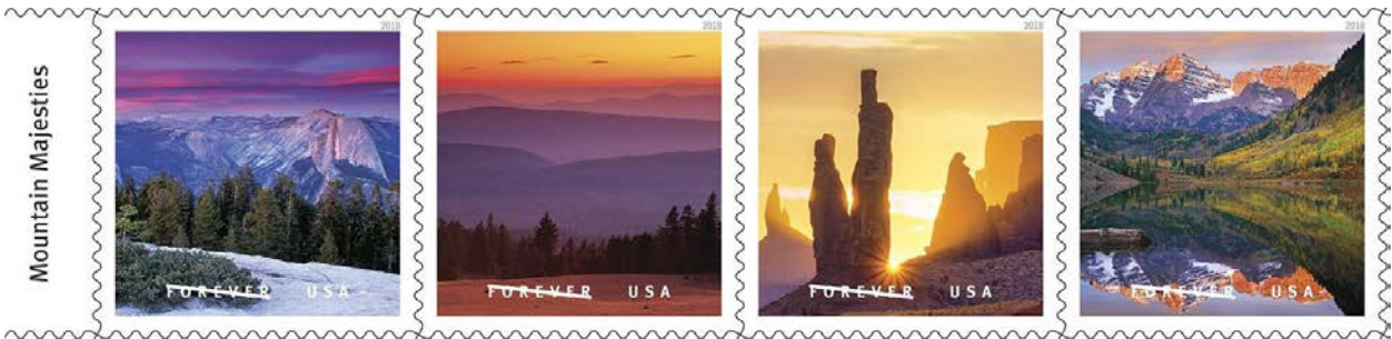
Yosemite National Park, CA, photograph by Gary Crabbe Crater Lake National Park, OR, photograph by Gary Crabbe Monument Valley Navajo Tribal Park, AZ/Utah photograph by David Muench Maroon Bells peaks in White River National Forest, CO, photograph by Tim Fitzharris