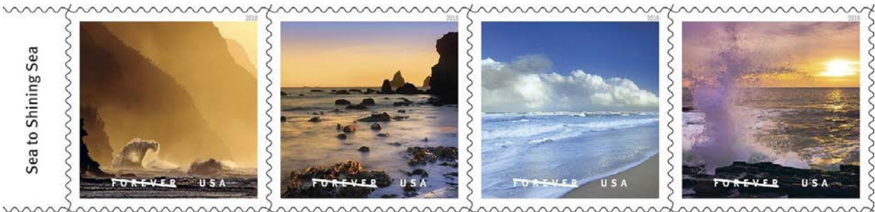
Nāpali Coast State Wilderness Park, Kauai, HI, Lone Ranch Beach, Samuel H. Boardman Scenic Corridor, OR, Canaveral National Seashore, FL, Bailey Island, ME