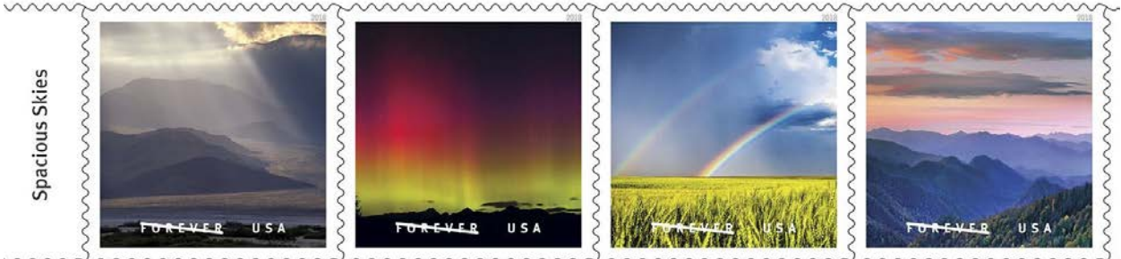
Death Valley National Park, CA/NV, Three Fingers Mountain in Mt. Baker-Snoqualmie National Forest, WA, Field in Kansas Great Smoky Mountains National Park, NC/TN

Each row of the 20-stamp pane illustrates one of five phrases from the song “America the Beautiful” famous first verses: “Spacious Skies” (top row), “Waves of Grain” (second row), “Mountain Majesties” (third row), “The Fruited Plain” (fourth row) and “Sea to Shining Sea” (bottom row). Each of the five phrases appears to the left of the row of stamps to which it applies.