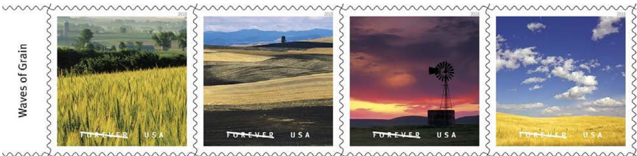
Field of wheat, WI, Plowed wheat fields, Palouse Hills, WA, Grasslands Wildlife Management Area, Merced County, CA, Field of wheat, MT